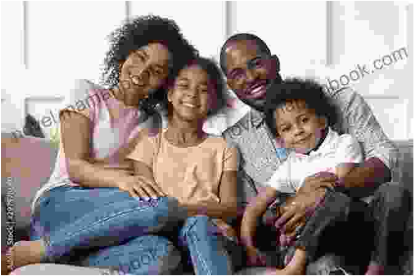
Colleen Farrelly, "The Family Album," 2010.