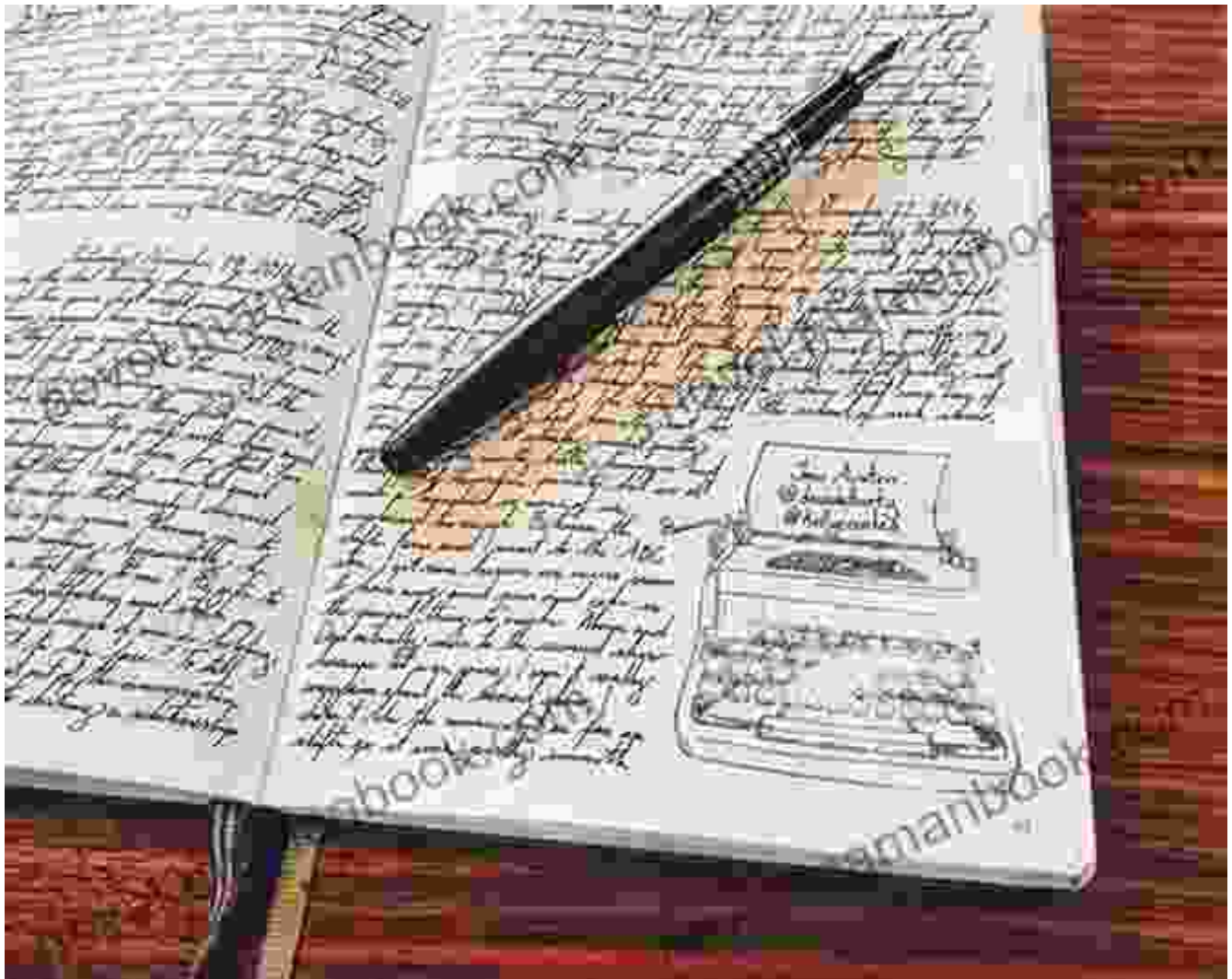
Franz Wright's handwritten lines of poetry.

Franz Wright's distinctive poetic style is characterized by its unflinching honesty, emotional intensity, and masterful use of language. In "Wheeling Motel," he employs a free verse form that allows for a seamless flow of consciousness, mirroring the protagonist's tumultuous inner world.